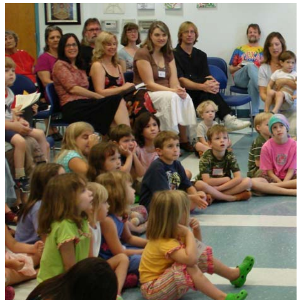
Children of all ages listen to the Story for all ages at a Wildflower Sunday service.