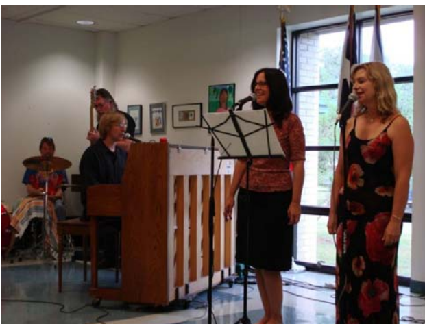
Peace Train performing on September 9