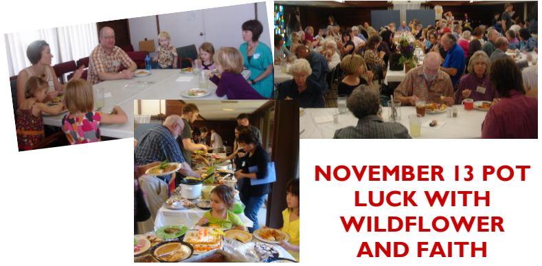
NOVEMBER 13 POT LUCK WITH WILDFLOWER AND FAITH