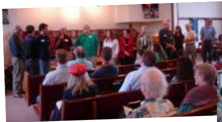
HONORING VETERANS ON NOVEMBER 6