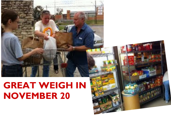
GREAT WEIGH IN NOVEMBER 20