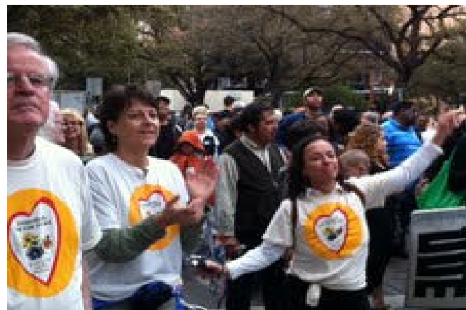
WILDFLOWERS CELEBRATE MLK DAY IN GRAND STYLE