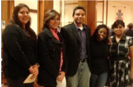
Three UT students and one Travis High student were the featured speakers at the January 13 Dream Sabbath. They spoke of the plight of immigrants and called for our support.